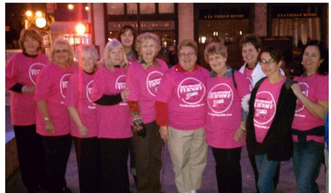
GFWC ladies outside one of the morning shows.

The General Federation of Women's Clubs (our mother organization) last week teamed up with AAA, Seventeen Magazine and the Department of Transportation to publicize the National Two Second Turn-Off Day on September 17 th . Members of area clubs attended a rally in Washington, DC. In New York club members appeared on the Early Show and the Today Show during the week leading up to the rally. They wore hot-pink tee shirts and held signs promoting safe driving. The purpose was to get people to pledge to turn off their phones before driving " —it only takes... two seconds. Taking your eyes off the road for two seconds doubles your chances of getting into a crash. Instead, use two seconds to turn off your phone before you hit the road—you could possibly save your life or the lives of others. "