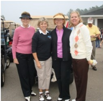
GWC Golf Team Members: