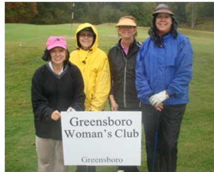
GWC Golf Team Members