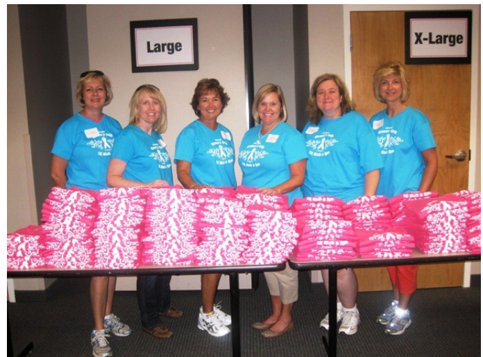
Ladies volunteering at the Women's Only Walk Run!